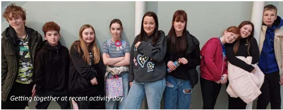
Getting together at recent activity day